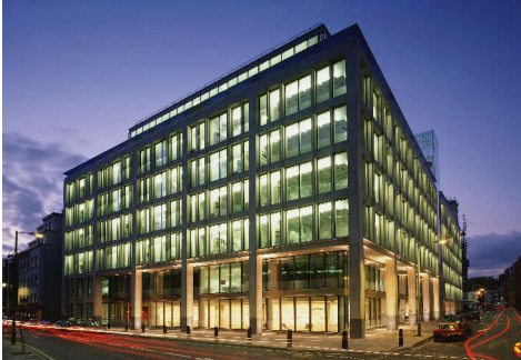
Slaughter and May's London head office.

Slaughter and May is regarded as one of the most prestigious law firms in the world. They advise on high profile and groundbreaking international transactions and have an excellent and varied client list that includes leading companies, organisations and governments.