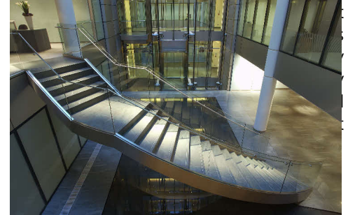
Reception area with water feature and sweeping staircase.